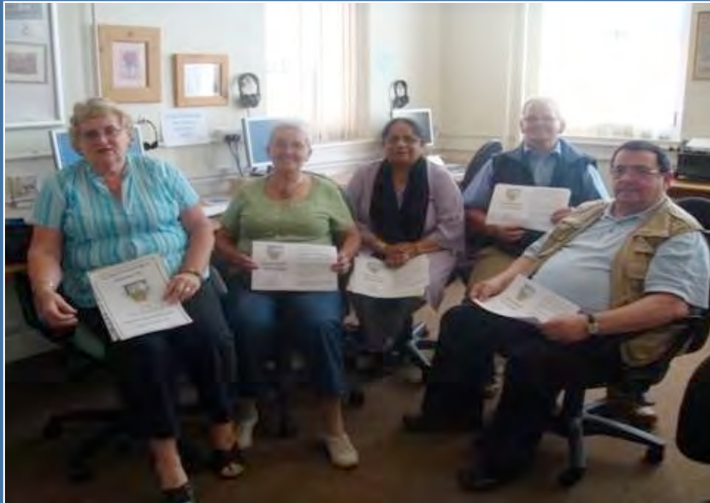
Participants from Age Concern Leicester Shire and Rutland's computer class